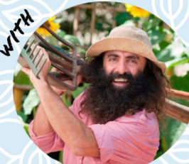
COSTA GEORGIADIS ABC's Gardening Australia

SUN 10 NOV @ MOODJI FARM, BERMAGUI PRESCHOOL